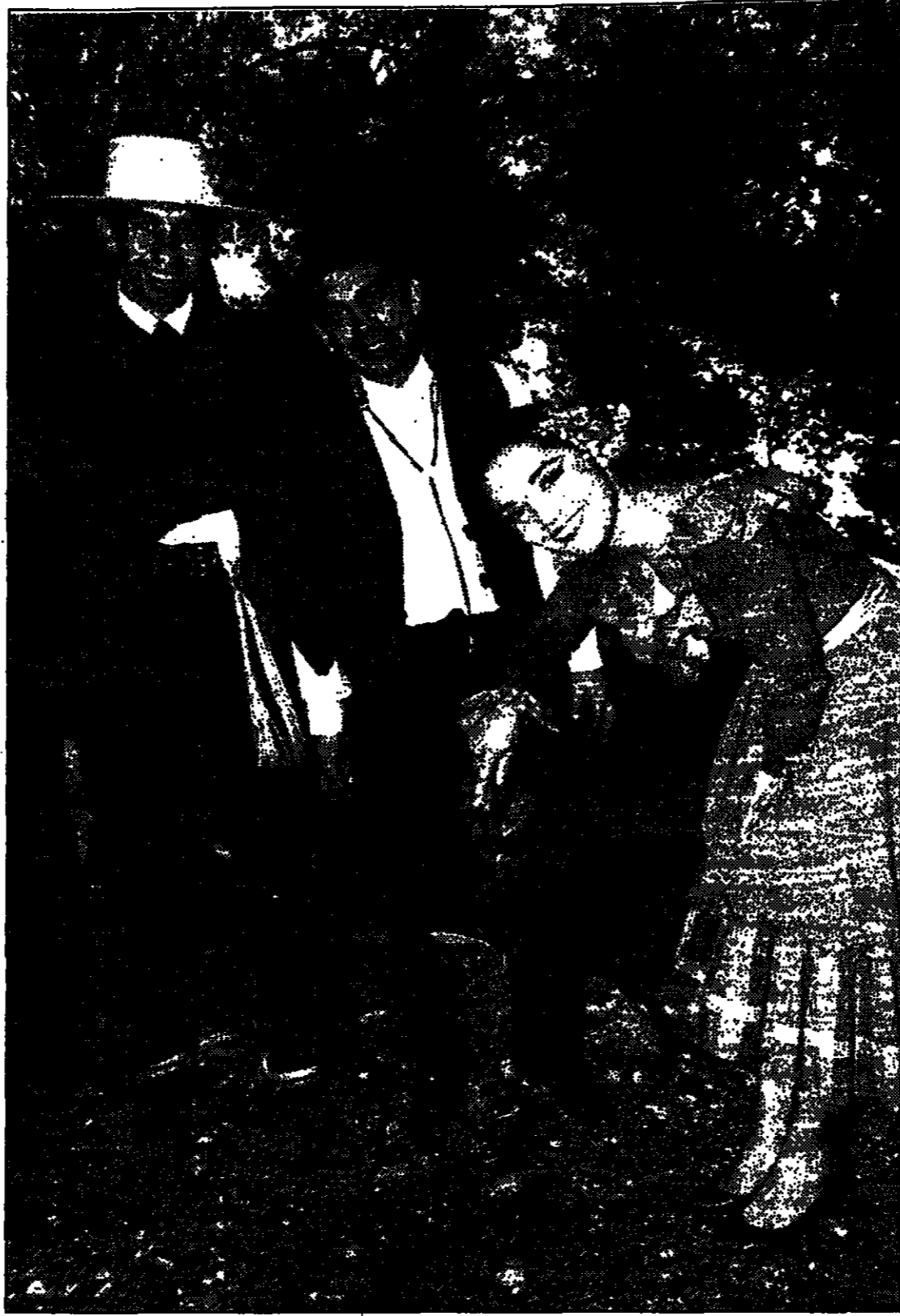
Members of the Bafochi National Ballet of Chile plant a tree yesterday in the Bernardo O'Higgins Jewish National Fund forest in Eshtaol. The planting was part of a ceremony marking Chile's national day.

It also charged that the bypass roads would come at the expense of improving dangerous roads within Israel and reducing traffic accidents, since the overall road-building budget was being cut.